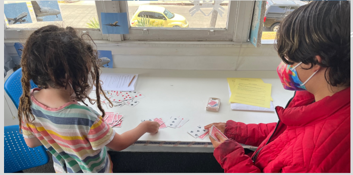
some of the eagles learning about probability and difficulty in gaming quest

Launchpad continued on their quest through Environmental Biology by wrapping up their soil lab, learning tons about pollution, and beginning their upcoming air quality lab!