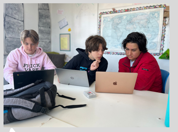
the navs testing each other's games foundation's books are getting illustrated!

Second to last week of the session meant the dial turned up to eleven as the Foundation and Navigators continued their quest through Game Design by slowly but surely turning their rough drafts into finished, polished, amazing games! But there were some bumps on the road; some learners struggled to pull everything together, others got stuck in the persnickety world of writing and editing their rules, and for others it all seemed to be a breeze! Just one more week till they get to show off their hard work to the public and they can't wait. Launchpad analyzed data collected in their air quality lab to see how much ozone they detected in our area, they set up a lichen lab they'll be showing off at Exhibition, and made progress on their final projects. What a busy week!